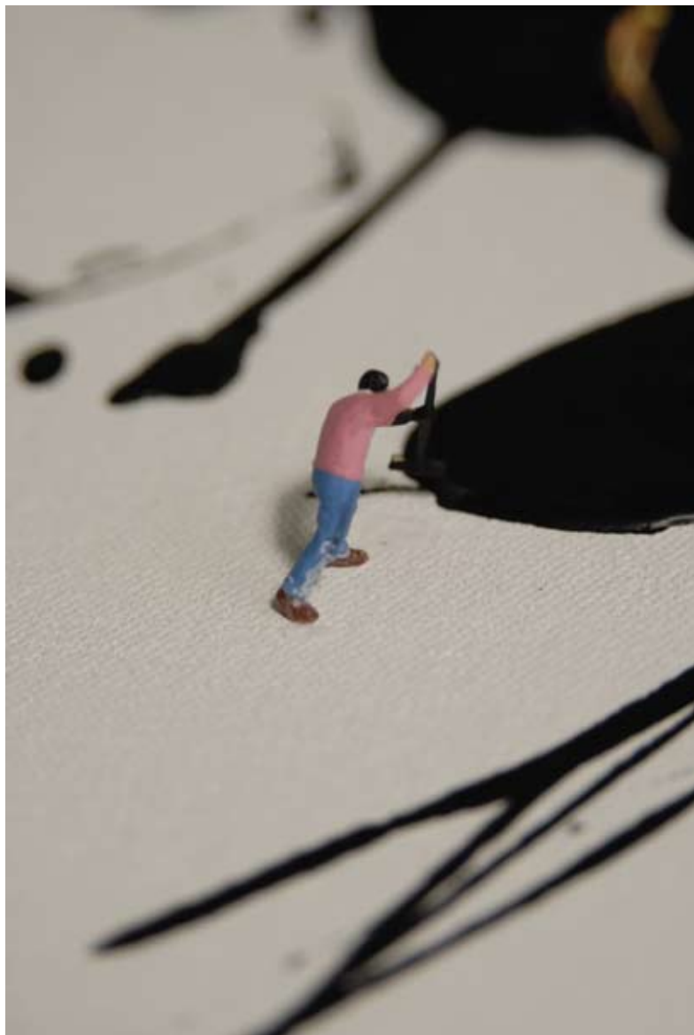
Liliana Porter , Untitled with black and white paint , 2008

Argentinean-born, New York-based Liliana Porter's neutral canvases are activated by tiny toy figurines. The artist plays with wry humor as the toys interact. Her narratives at first appear to have a cute, tender, and intimate feeling to them, yet on closer inspection they transform into troubling situations. The works in this exhibition present characters trapped in some sort of disastrous spill of paint. Yet some figures, mainly female, are concentrating on the task of cleaning up. Porter's work not only addresses issues of loss, but also of learning and renewal. Few works that deal with overwhelming situations also address the potential for healing and the optimism for reconstruction with the keen clarity that Porter presents.