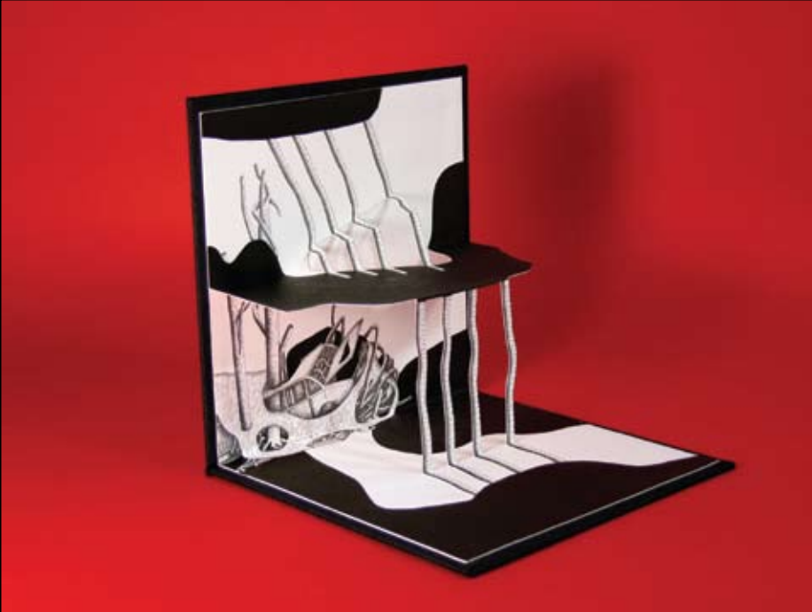
Catarina Leitão. Uplift (booklet 3 of 7 booklets), 2008

The New York City-based Portuguese artist Catarina Leitão's intensely traced ink drawings depict characters dressed with protective gear who wrestle indecipherable organic shapes that range from natural-looking creeper plants to animated oil spills. It is not clear, though, if the uncanny elements are taking over or if the characters are taming the mysterious vines and spills. What is clear is that the illusion of a victimized nature is gone. 3 For the artist, the drawings address the ambivalence between “what is nature” and “what is a mutation.” 4 Have we created a nature that is toxic and that in its polluted version will reach us all? Are these drawings about humans trying to protect nature from the aggressions of civilization or are we trying to protect ourselves from a deviant nature? Leitão's small-scale pop-up books with the same theme further articulate and animate the dilemma.